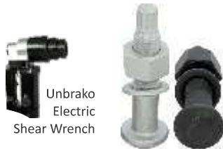
Unbrako Electric Shear Wrench

Tension Control Structural Bolt is an easy to install Heavy Duty Bolt used in Steel Frame Construction. It has its own built-in torque control device. The outer socket of wrench rotates the nut until the torque control groove in the spline shears off, thereby achieving proper bolt tension.