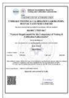
NABL ISO/IEC 17025:2017